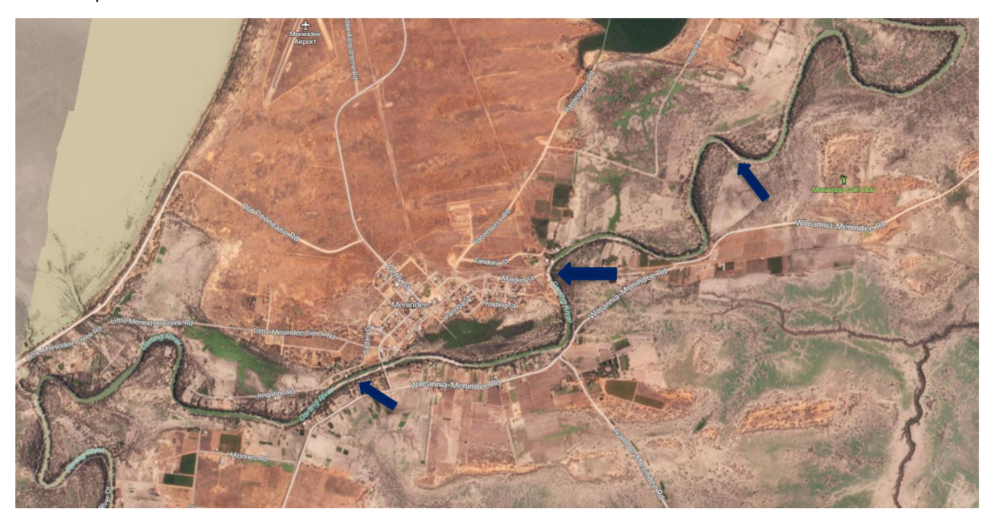
Figure 1: Planet satellite image from 17 March 2023 showing dead fish accumulating along the banks of the Darling River at Menindee

junction of the Darling River and Menindee Creek. The imagery from 22 March (Figure 3) shows that the accumulation of dead fish that was at the junction of the Darling River and Menindee Creek has been dispersed.