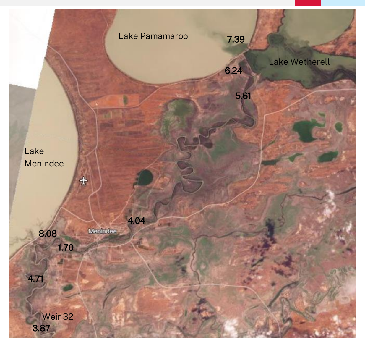
Figure 4: Planet satellite image - Image 21 March. Dissolved oxygen data collected 22 March (mg/L)

Dissolved oxygen in the Darling River downstream of Menindee at Weir 32 had been above the safe level for fish health but decreased rapidly on 17 March, coinciding with the fish deaths at Menindee upstream. Oxygenated water is being released from Lake Menindee to dilute the poor quality water coming down the Darling River. Monitoring on 22 March shows that dilution of the low oxygen water is occurring and that turbulence from the high flow velocity is mixing oxygen through the whole water column. The dissolved oxygen result from near the water surface at Weir 32 are higher than the readings from the continuous sensor at the gauging station (Figure 5). The sensor at Weir 32 is set at a fixed depth lower in the water column of the weir pool. Oxygen levels can be higher near the water surface than on the bottom of pools.