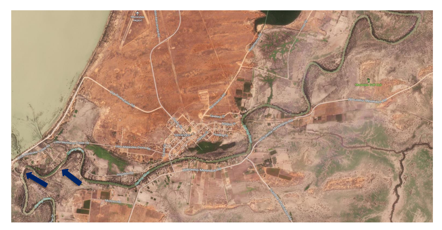
Figure 2: Planet satellite image from 19 March 2023 showing an accumulation of dead fish at the junction of the Darling River and Menindee Creek