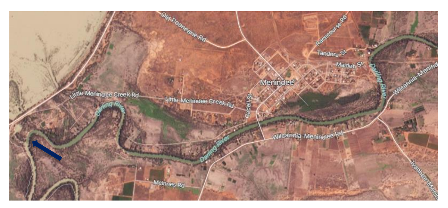
Figure 3: Planet satellite image from 21 March 2023 showing the accumulation of dead fish that was at the junction of the Darling River and Menindee Creek has been dispersed

Figure 4 is a Planet satellite image showing the Darling River and Menindee Lakes at Menindee on 21 March. Dissolved oxygen monitoring results collected by WaterNSW on 22 March are shown on Figure 4.