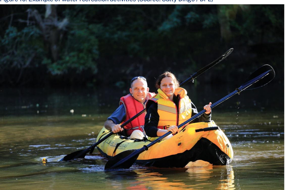
Figure 10. Example of water recreation activities

Where recreation is allowed, common activities include fishing (subject to licensing and catch limits), non-motorised boating (e.g., kayaking, canoeing, Figure 10), walking, bike riding and picnicking. Some reservoirs have designated areas for swimming. Where water based recreational activity is allowed, additional water treatment processes, including more sophisticated filtration and ultraviolet light disinfection, is required to ensure the water is safe to drink after human contact. In some cases, the reservoirs were removed from the drinking water supply to support recreation instead.