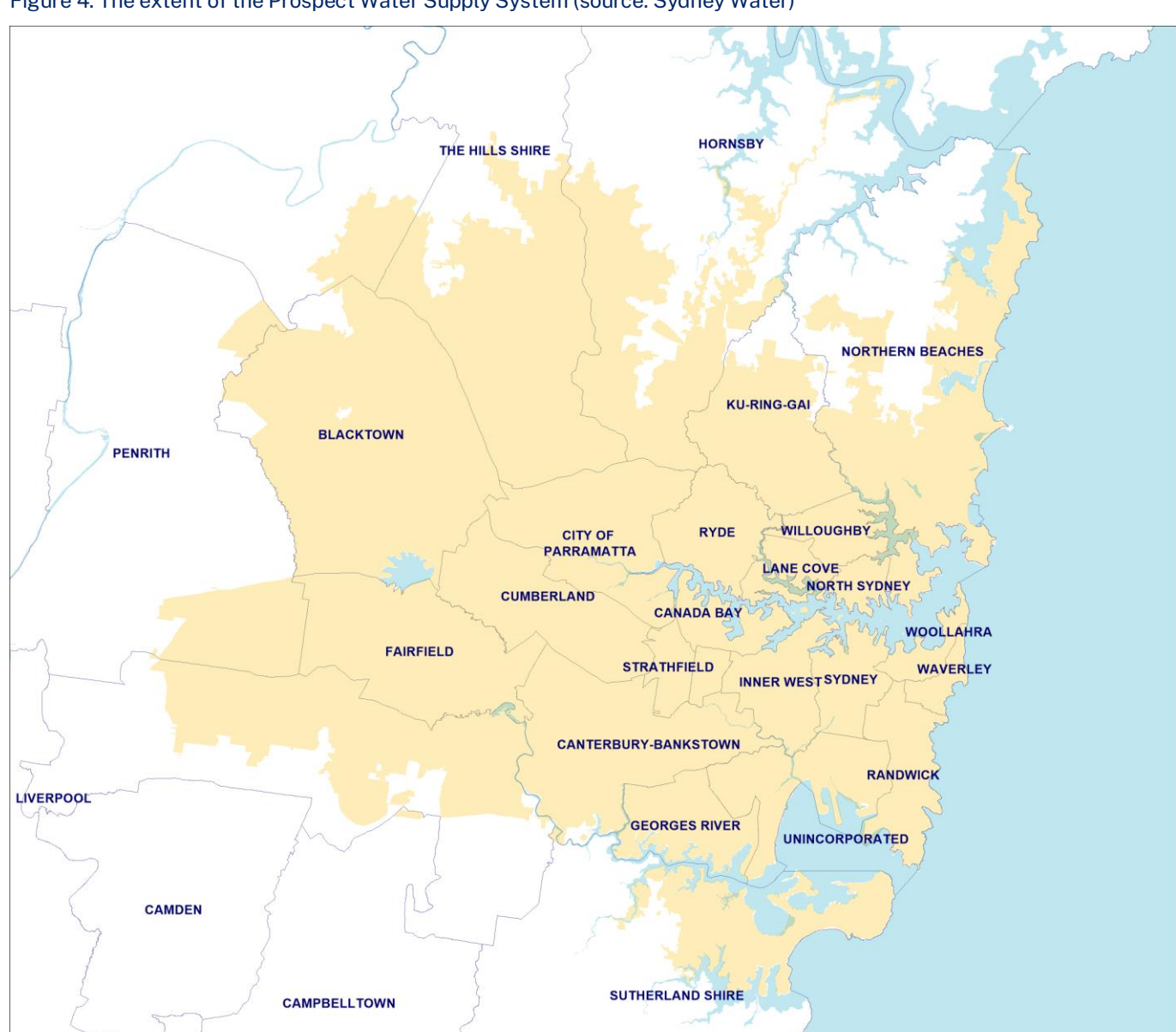
Figure 4. The extent of the Prospect Water Supply System

The extent of the Prospect supply system is shown in Figure 4, stretching from Palm Beach in the north, south to Sutherland and west to Liverpool, Blacktown and the northwest. As the city grows more customers will connect to the water distribution systems supplied by the water filtration plant.