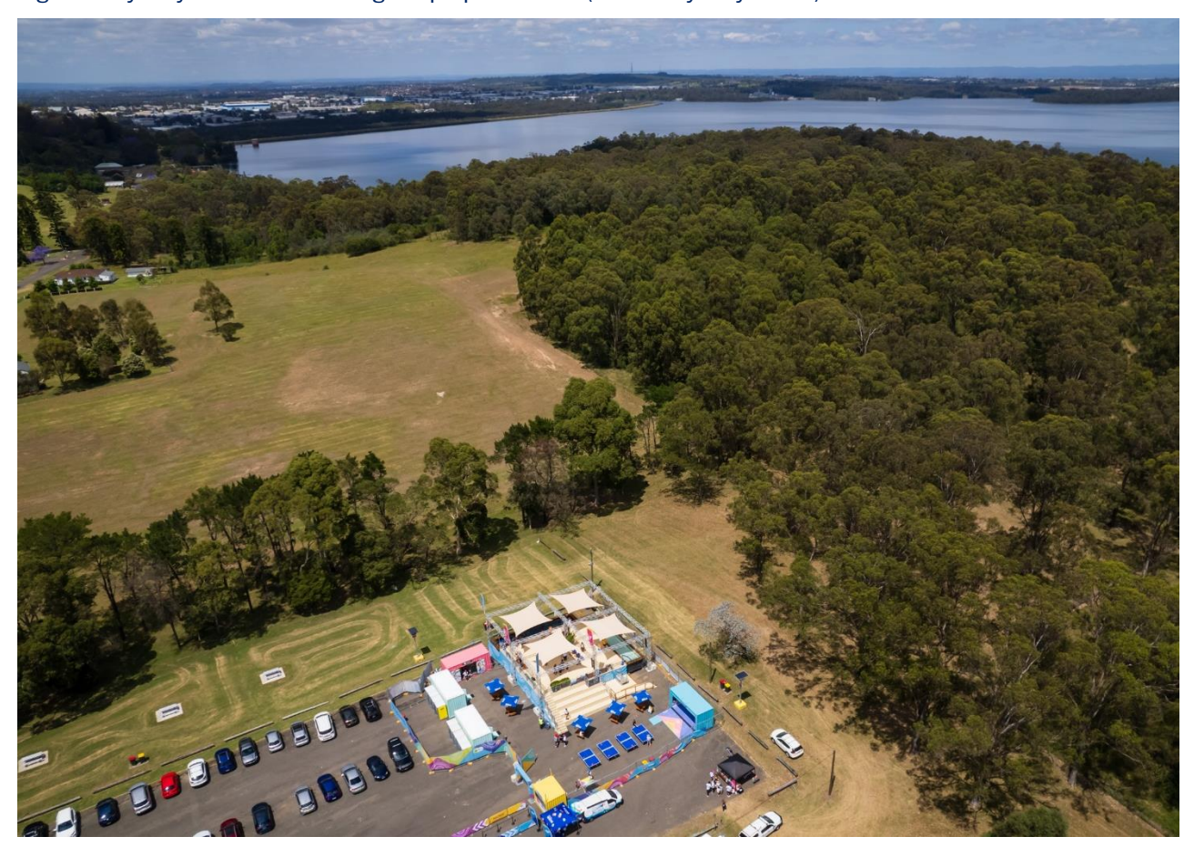
Figure 2. Sydney Water Urban Plunge Pop-up Swim site