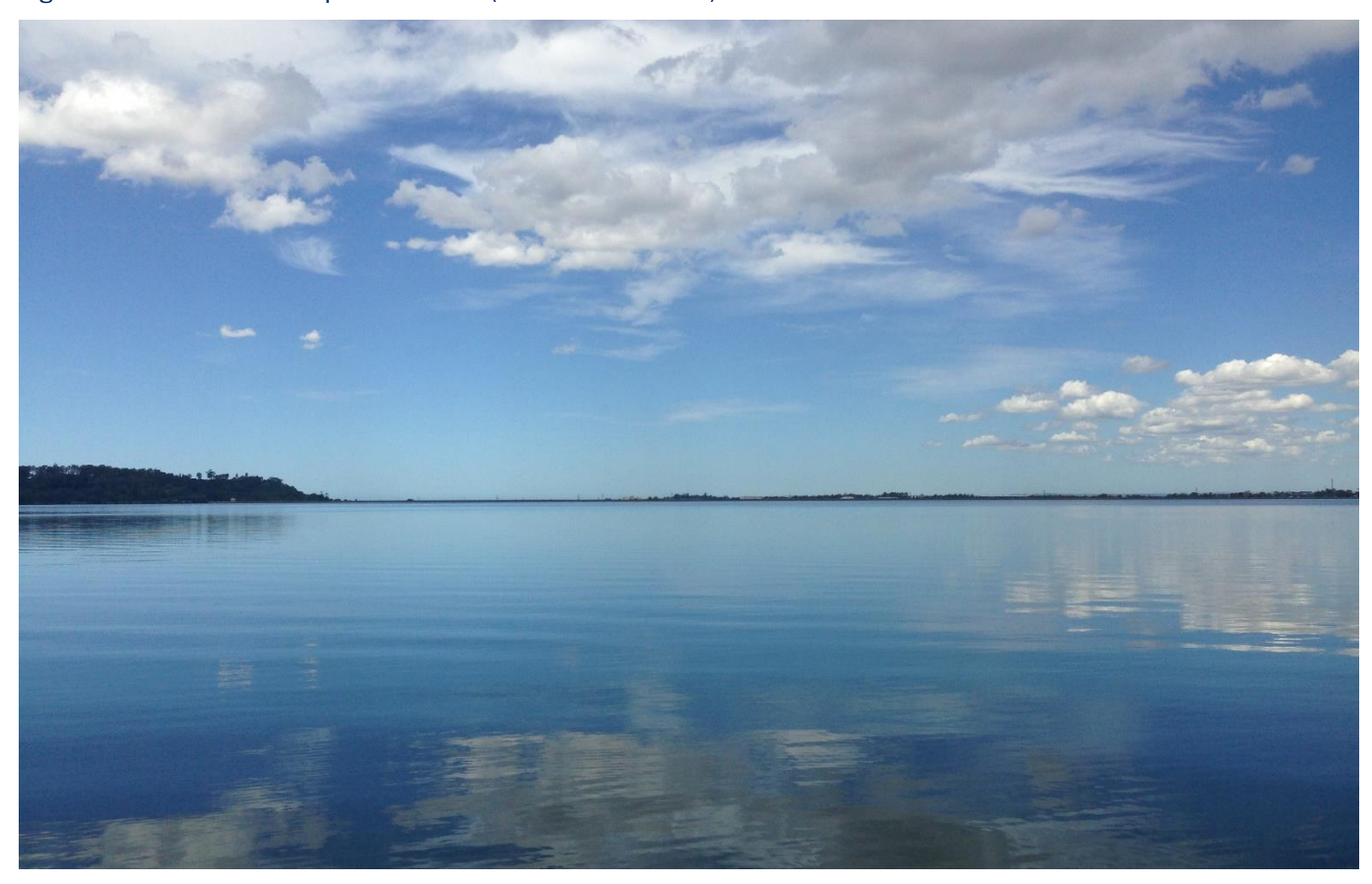
Figure 11. Views across Prospect Reservoir