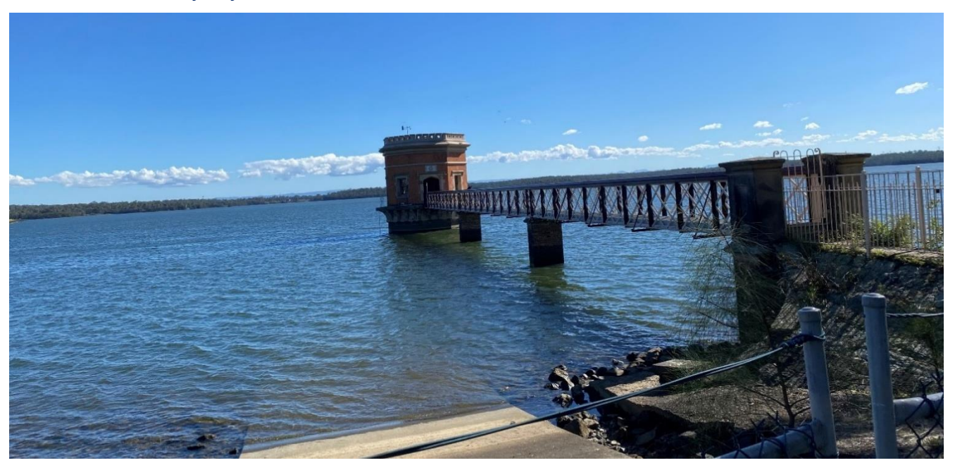
Figure 5. Prospect Reservoir: Outlet Tower – this brick control tower has all the old machinery from 1888 used to supply water to the whole of Sydney.

landscape elements and structures, including pumping stations, would require approval from the NSW Heritage Council under section 60 of the Heritage Act 1977 .