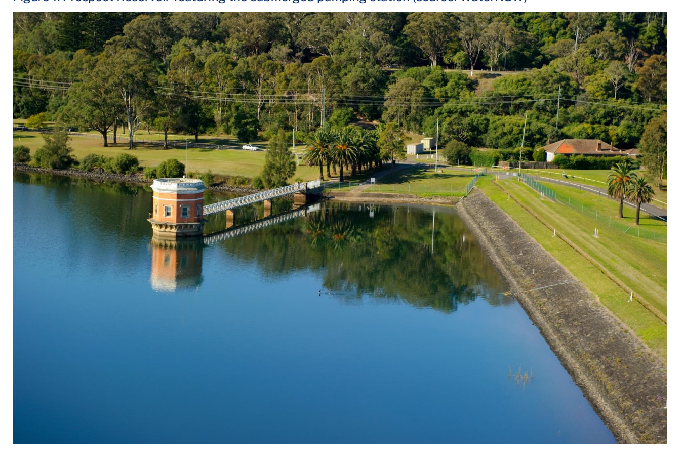
Figure 1. Prospect Reservoir featuring the submerged pumping station

Your feedback will contribute to the final outcomes around the use of Prospect Reservoir and its surrounding lands.