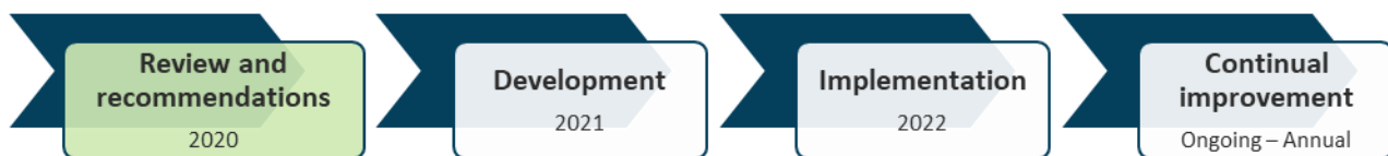
Figure 1: Stages for implementation of the best practice review

In March 2021, representatives from the NSW, Victorian and Australian governments endorsed the recommendations of the independent review at the Snowy Water Government Officials Committee meeting. The department is moving to implement the recommendations over the coming year, with the aim of adopting the new practices in 2022.