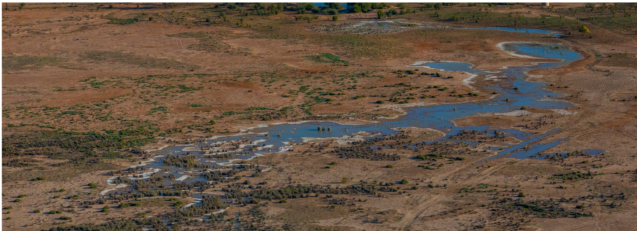
Image courtesy of Joshua Smith, Department of Planning and Environment. Flowing bore for water stock, Narriearra Station.