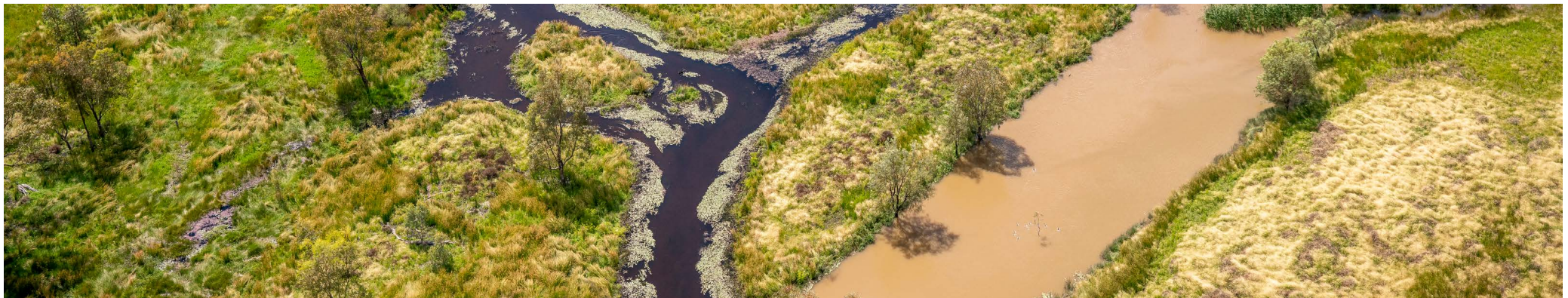
Southern Lagoons, Macquarie Marshes Nature Reserve.