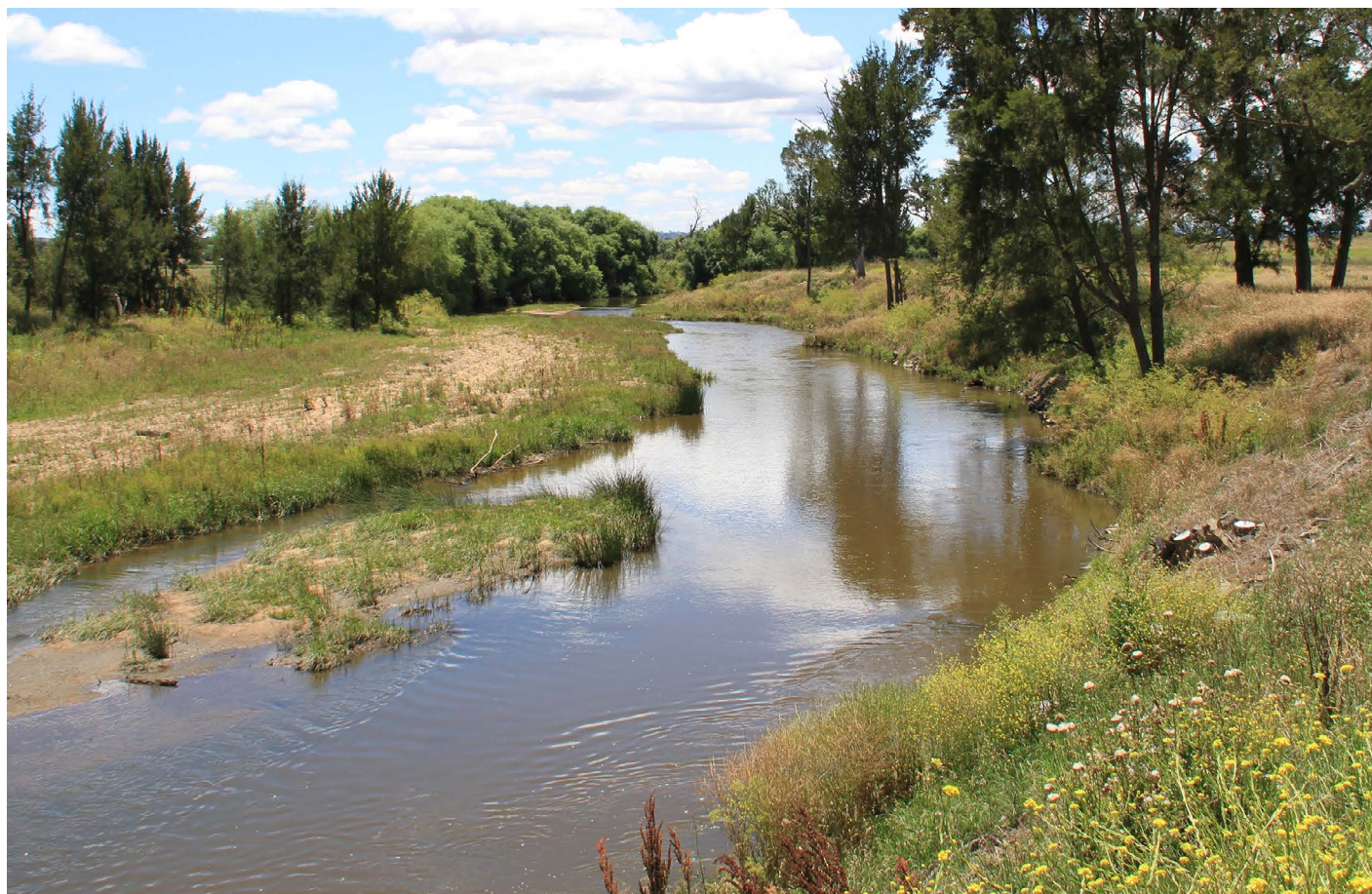
Macquarie River near Bathurst.

We will develop and publish a Monitoring, Evaluation and Reporting framework. This will ensure the strategy and plan are adaptive to changing community needs.