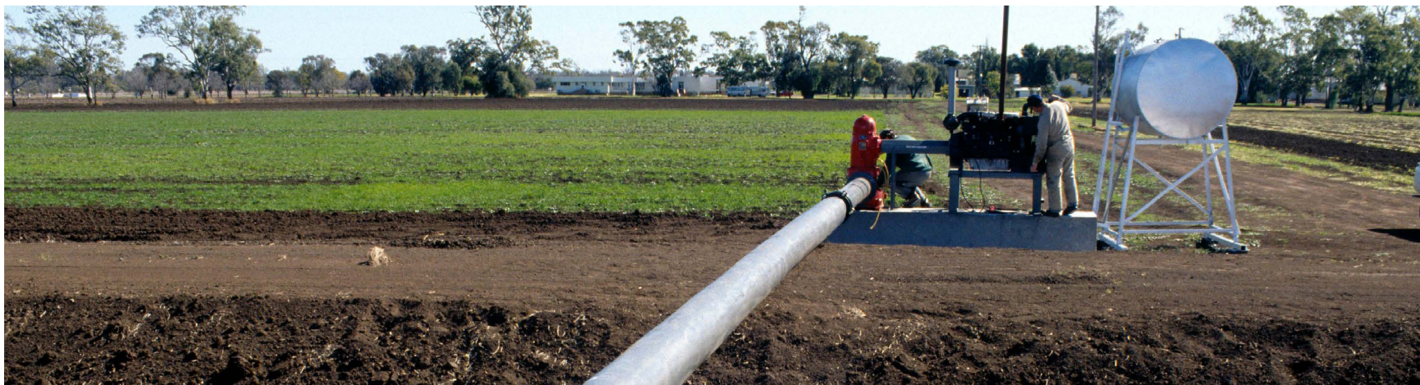
Irrigation bore outlet, Narrabri.