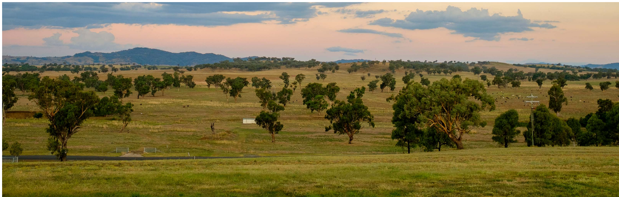
Goonoo Goonoo Station, Tamworth.