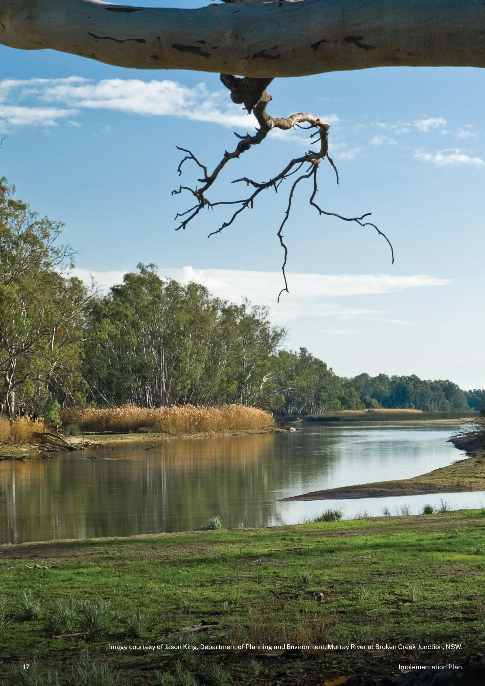
Image courtesy of Jason King, Department of Planning and Environment. Murray River at Broken Creek Junction, NSW.