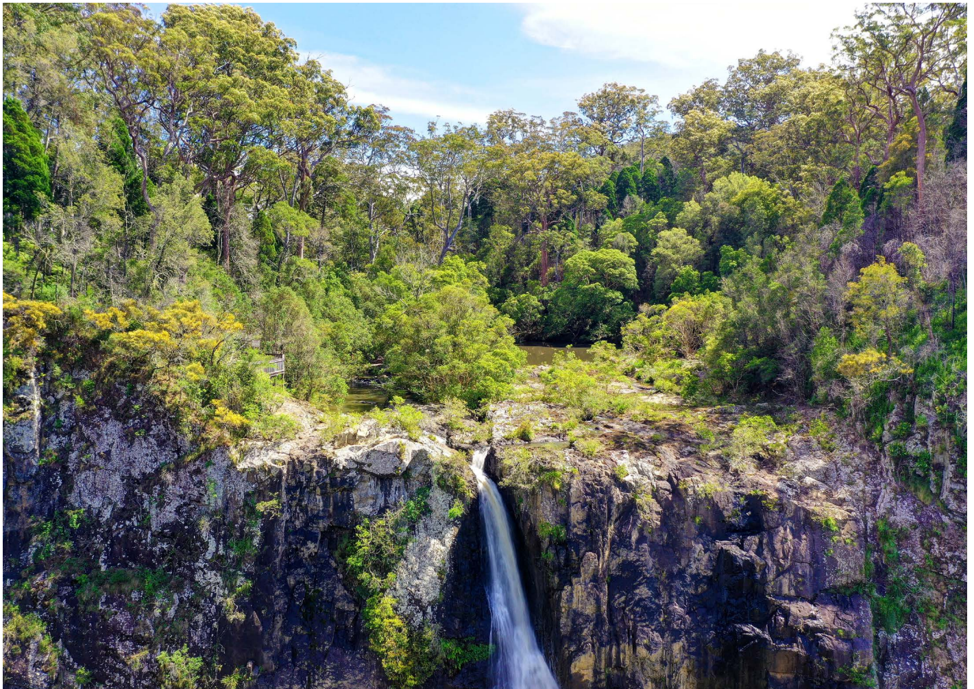
Ellenborough Falls, Elands NSW.

The plan identifies initiatives that work towards the priorities and actions of the strategy and is not intended to capture all 'business as usual' activities.