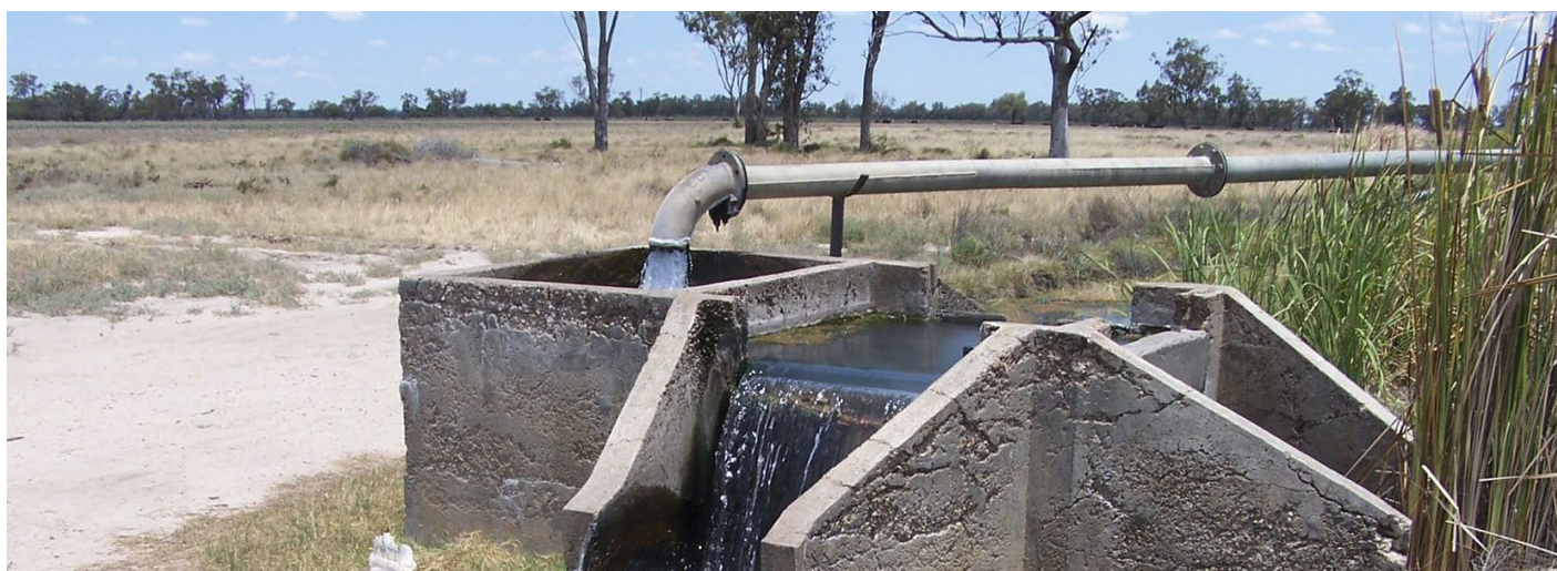
Bore, Buronga East.