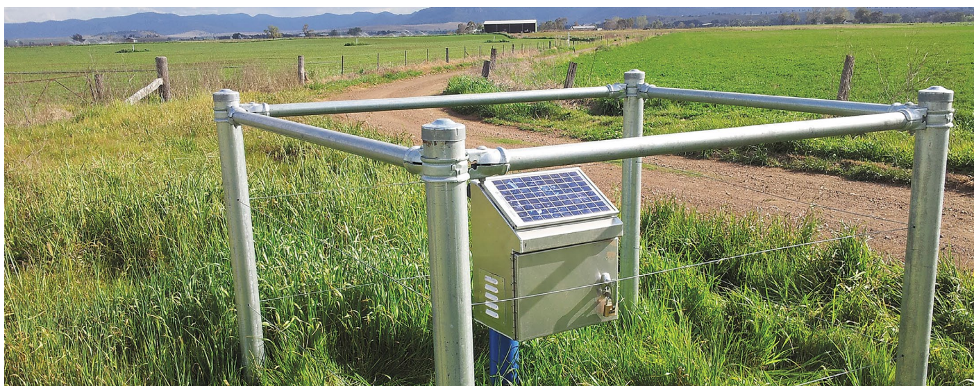
Image courtesy of Department of Planning and Environment. Telemetered monitoring bore.