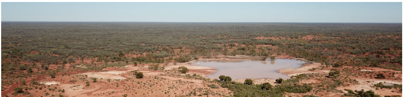
Mascot Spring, Great Artesian Basin.

The NSW Groundwater Strategy is part of a suite of regional and metropolitan strategies aimed at ensuring we have resilient water services and resources in NSW in the decades ahead. The strategy is an element of the NSW Water Strategy , a 20-year 'roadmap' that aims to improve the security, reliability, quality and resilience of the state's water resources. It has been developed through a state-wide process of evidence building and engagement, and it also draws together solutions to common state-wide challenges identified in the 12 NSW regional water strategies.