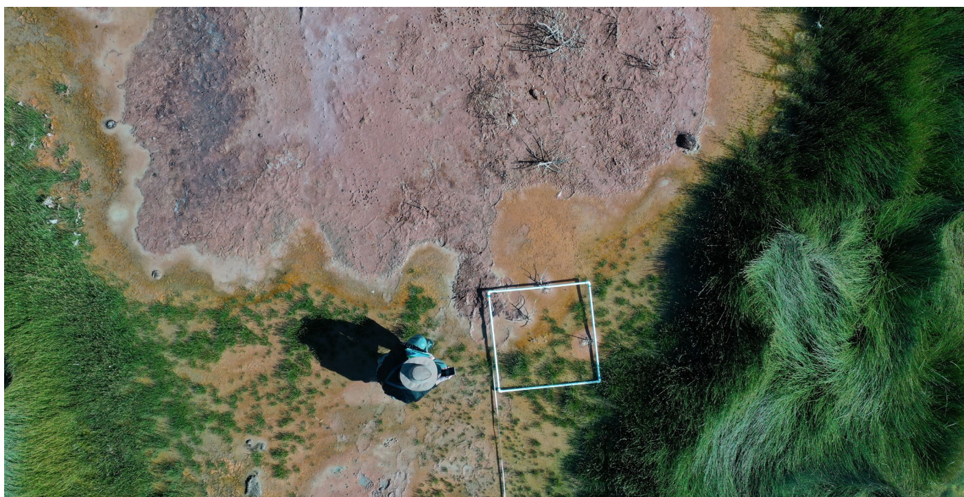
Bingawilpa Spring.