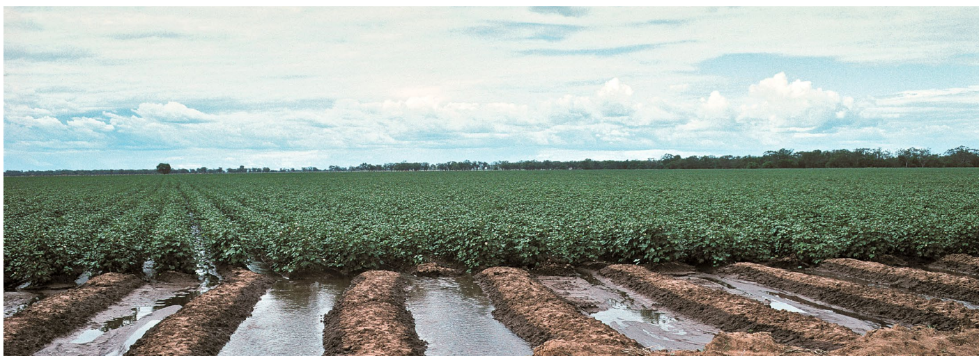
Furrow irrigation of cotton, Warren.