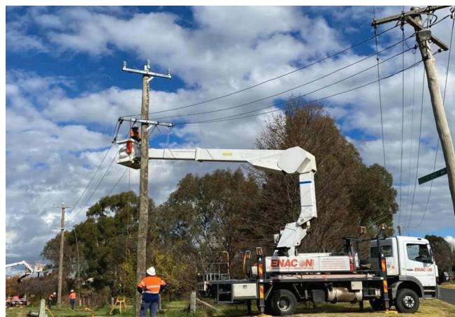
Enacon Group undertaking overhead electrical works on another project