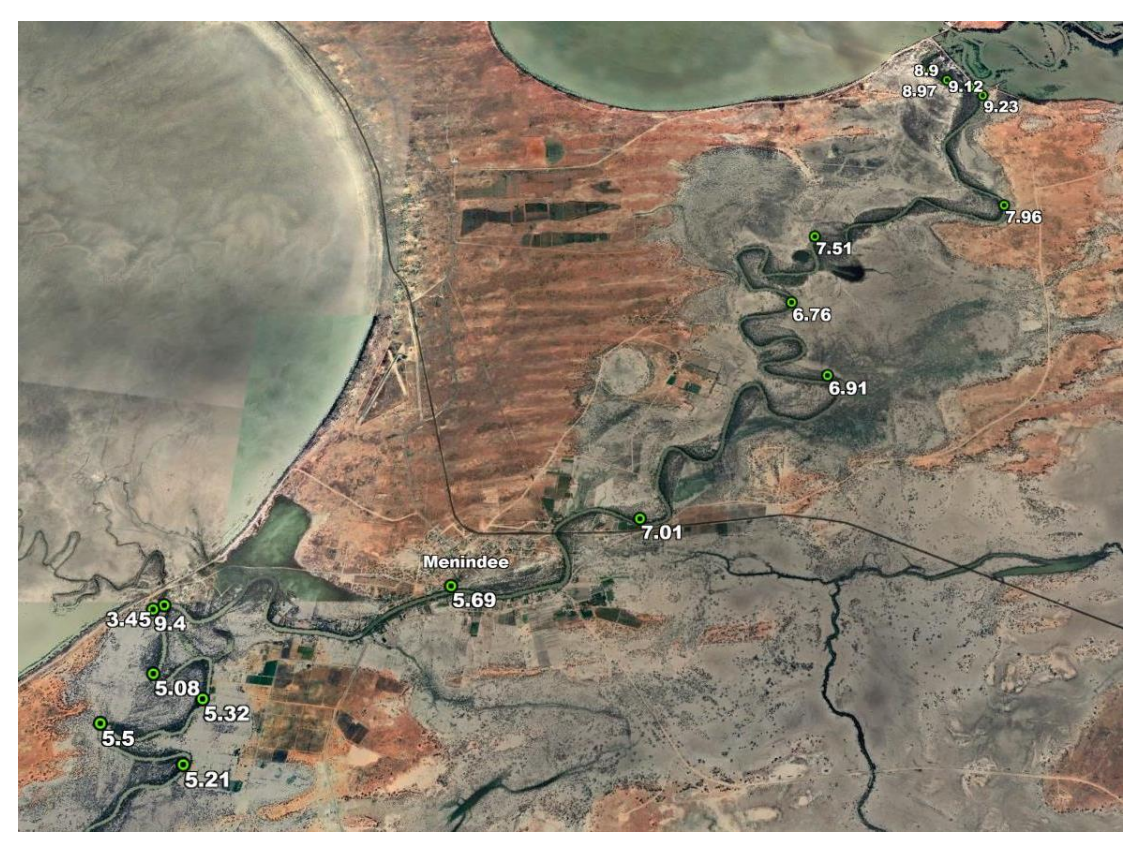
Figure 1: Google Earth image showing dissolved oxygen results (mg/L) from the Lake Pamamaroo outlet to downstream of the Darling River/Menindee Creek junction on 5 & 6 June 2023

Figure 1 is a Google Earth image showing the location and results from the survey of dissolved oxygen levels down the Darling River on 5 and 6 June from Lake Pamamaroo, through Menindee town and down past the junction with the inflow from Lake Menindee. The results show that there was a gradual decrease in oxygen levels with distance down the Darling River. The lowest result was immediately upstream of the Darling River-Menindee Creek junction (3.45 mg/L). Dissolved oxygen levels improve again following dilution by the oxygenated water being released from Lake Menindee. As a general guide, native fish and other large aquatic organisms require at least 2 mg/L of dissolved oxygen to survive but may begin to suffer if levels are below 4 to 5 mg/L for prolonged periods.