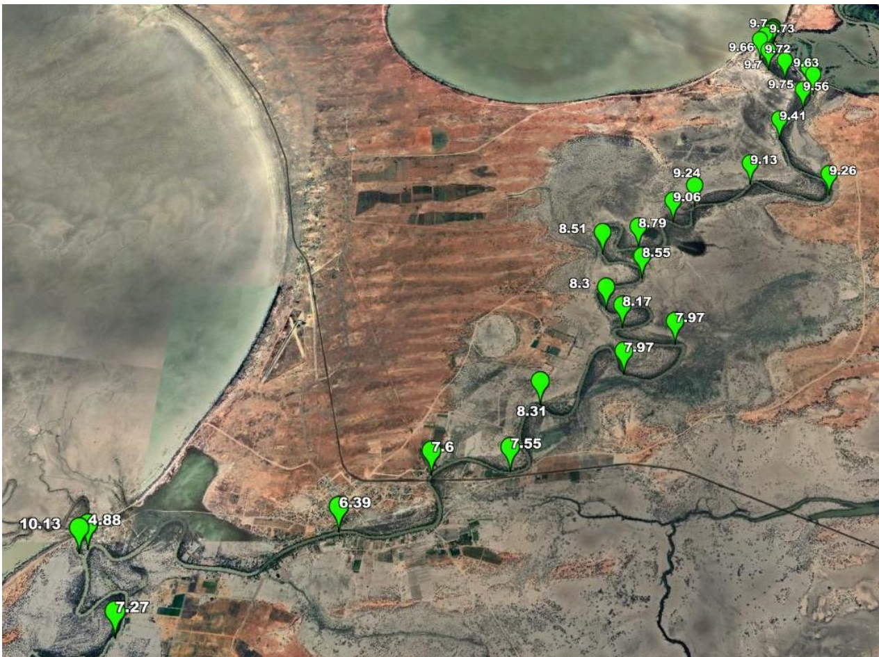
Figure 1: Google Earth image showing dissolved oxygen results (mg/L) from the Lake Pamamaroo outlet to Menindee Creek on 25 May 2023.

Figure 1 is a Google Earth image showing the location and results from the survey of dissolved oxygen levels down the Darling River on 25 May from Lake Pamamaroo, through Menindee town and down past the junction with the inflow from Lake Menindee. The results show that there was a gradual decrease in oxygen levels with distance down the Darling River. The lowest results were at Menindee township (6.39 mg/L) and immediately upstream of the Darling River-Menindee Creek junction (4.88 mg/L). Dissolved oxygen levels improve again following dilution by the oxygenated water being released from Lake Menindee. As a general guide, native fish and other large aquatic organisms require at least 2 mg/L of dissolved oxygen to survive but may begin to suffer if levels are below 4 to 5 mg/L for prolonged periods.