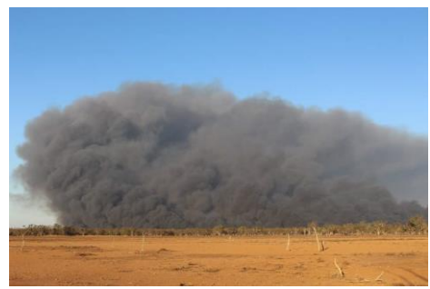
North Marsh reed bed, October 2019

The North Marsh reed bed (the largest reed bed in the Murray Darling Basin) caught a lightning strike in October 2019 and about 5,000 ha was burnt.