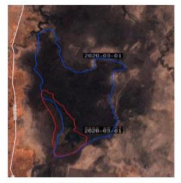
Image taken 1 March 2020 with red area showing inundation area at that time and the blue line the extent of the burnt area

By 1/3/2020, less than 1,200 ha of the 5,000 ha burnt North Marsh Reed bed had been inundated.