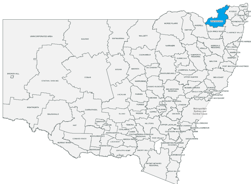
Figure 1. Map showing the location of Tenterfield Shire local government areas in northern NSW.